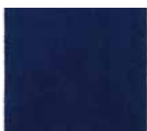
new classics 10218