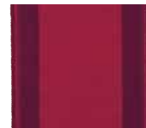
new classics 10300