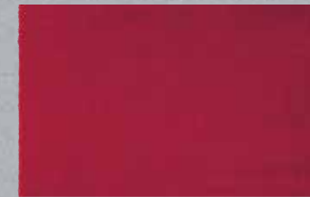
new classics 10200