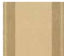
new classics 10301