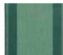
new classics 10307