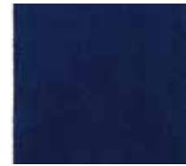
new classics 10218