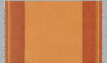
new classics 10306