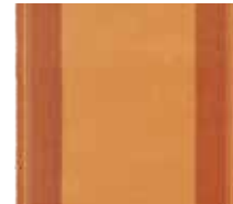
new classics 10306