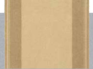
new classics 10301