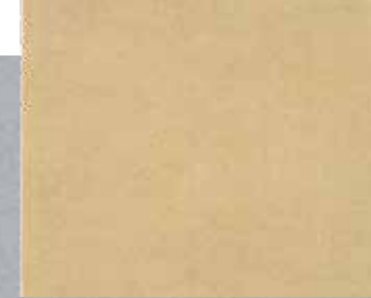
new classics 10201