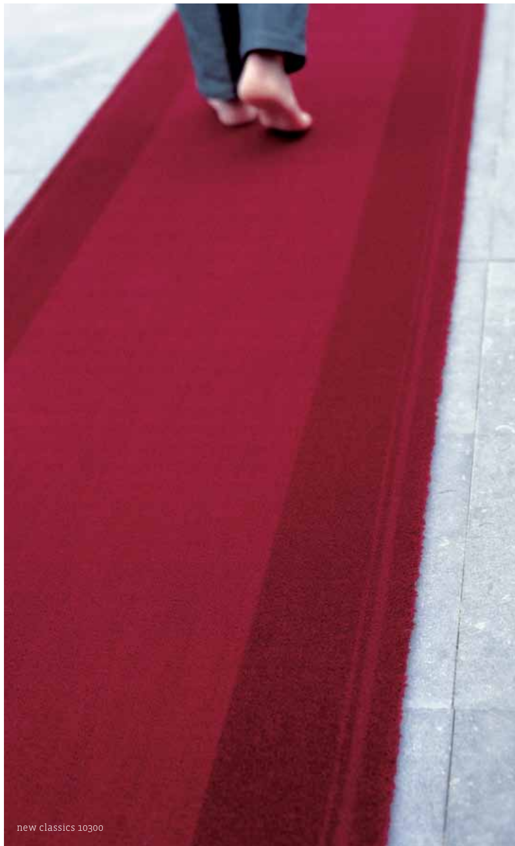
new classics 10300