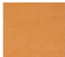
new classics 10206