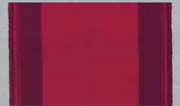
new classics 10300