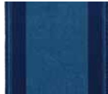
new classics 10308