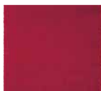
new classics 10200