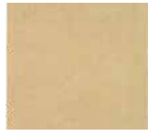
new classics 10201